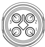
Pin Assignments Front View