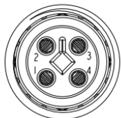
Pin Assignments Front View