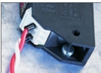
Protector flat mounted on side.