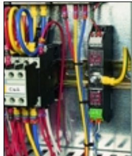
ESP 30E installed on top hat DIN rail inside a process control cabinet.

If the protector is to be mounted directly onto a PCB, use the ESP PCB/**E protectors. For some data and signal applications, the lower cost ESP **D series may be suitable.