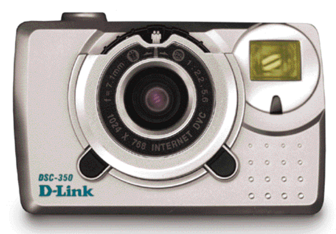
The DSC-350 is a three-in-one solution that combines the features of a digital still capture camera with a digital video camera and a PC WebCam wrapped into one convenient pocket size device

The D-Link DSC-350 Dual-Mode Camera ships complete, providing a tilt-swivel base, tripod socket, handy carrying case, wrist strap, USB cable and all the necessary hardware and software for a user to begin making digital photos and videos immediately. The DSC-350 can hold up to 145 still images in its highest resolution (1024 x 768) or 4 minutes of video on its 8MB of flash memory. The still images are saved in JPG format, and the video is saved in AVI or MPG format for maximum compatibility with most Microsoft Windows applications. Also, the DSC-350 draws power directly from the USB bus making it ideal for use with a laptop or other portable computer.