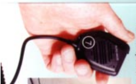
7 CMP1 Compact lightweight remote speaker microphone