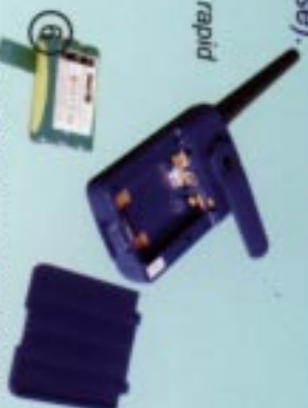
6 CNB1 Spare 3.6 v 550mAh Ni-MH battery pack