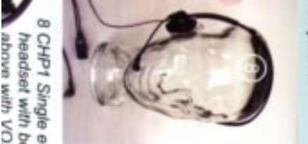
8 CHP1 Single earpiece lightweight headset with boom microphone. As above with VOX option - CHP1V