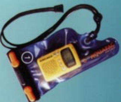
1 AQ1 Waterproof aqua bag & strap

The EURO-WAVE is supported by a wide range of useful accessories. Protect your transceiver from weather and damage with these attractive purpose-designed cases.