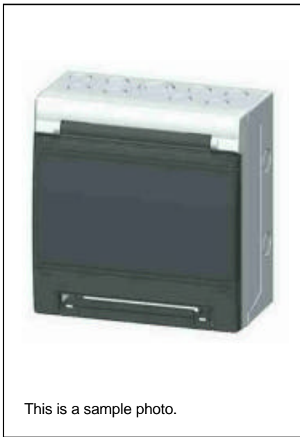
This is a sample photo.