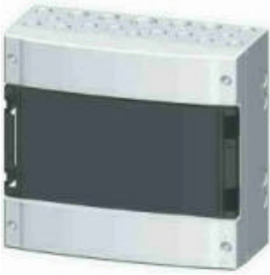
This is a sample photo.