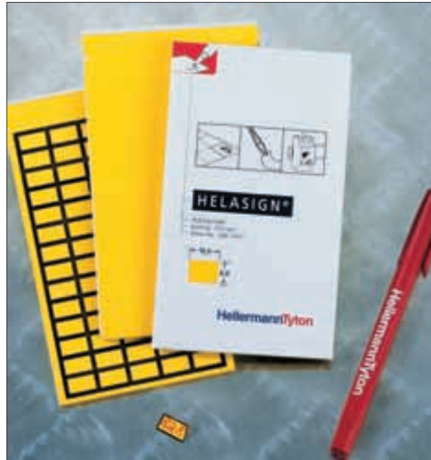
Always on hand: Labels in a convenient, pocket sized and lightweight booklet.

The bright yellow cotton labels are supplied with or without a black border in handy pocket sized booklets. For fast on-site identification of component parts, switching devices and other operating equipment. The labels are resistant to oils, water and dust and can be removed without leaving a sticky residue. Labels can even be applied to uneven surfaces and are available in different sizes from 15 x 6mm to 38 x 11mm. The booklet covers act as an effective barrier to dust and dirt so your labels remain clean before use. An applicator tool is supplied with every HELASIGN booklet for clean application of the labels (e.g. with dirty hands). For professional hand inscriptions we recommend the T82 marker pen which has fast-drying and UV-resistant ink.