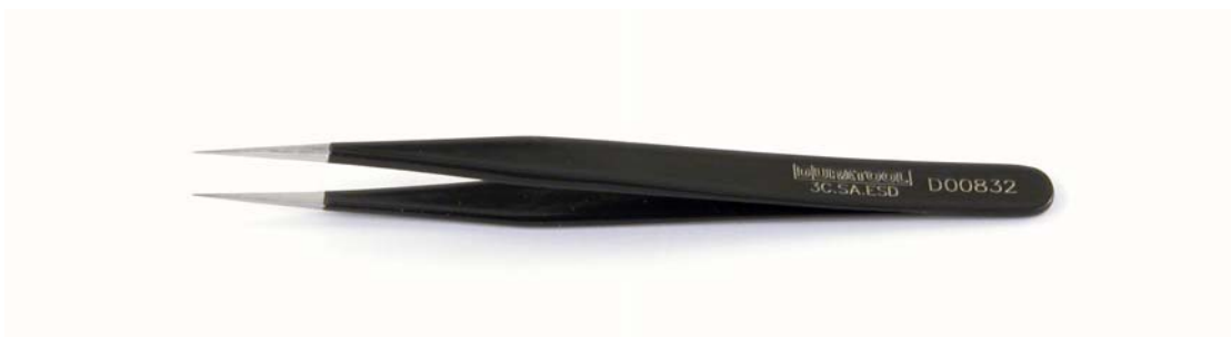
D00832 Sharp Tweezers (3C.SA ESD) 110mm