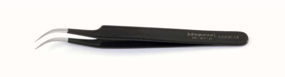
D00834 Fine Curved Tweezers (7A.SA ESD) 115mm