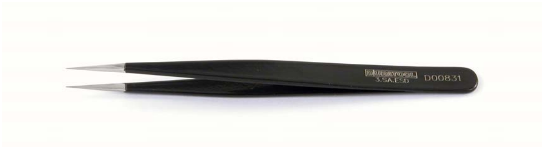
D00831 Sharp Tweezers (3.SA ESD) 120mm