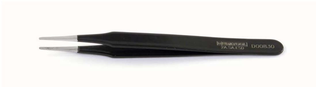
D00830 Flat Round Tweezers (2A.SA ESD) 120mm

Duratool Tweezers made of Anti-Magnetic/Anti-Acid stainless Steel with ESD polyester epoxy coating ( 10^5 - 10^6 Ohm).