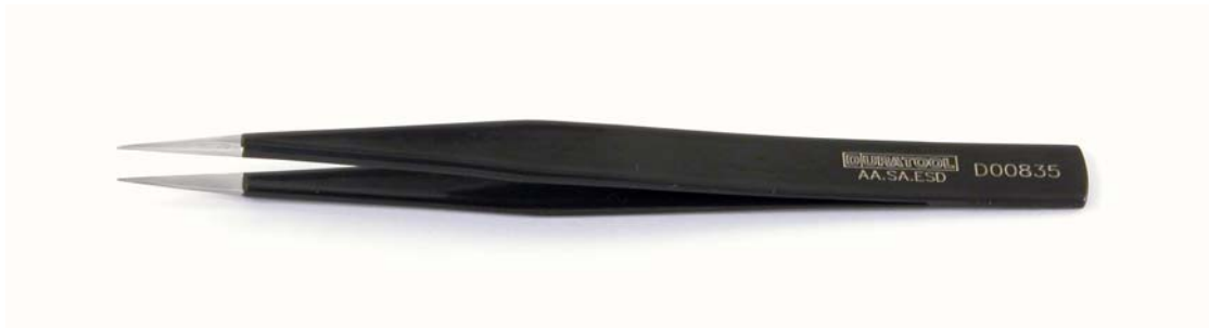
D00835 Straight Fine Tweezers (AA.SA ESD) 130mm