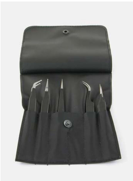
D00839 Tweezers Kit with D00831, D00833, D00834, D00836, D00837 (3, 5, 7A, 12SMD, 13SMD)