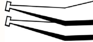
D00836 SMD Tweezers for handling and positioning 2 and 3 lead SOT (12.SA.SMD) 120mm/45° bent