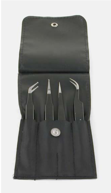
D00838 Tweezers Kit with D00831, D00834, D00836, D00837 (3, 7A, 12SMD, 13SMD)