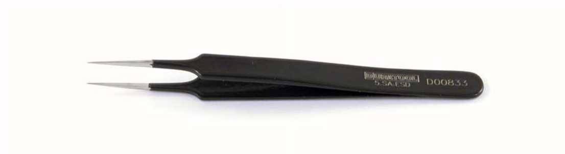
D00833 Fine Tips Tweezers (5.SA ESD) 110mm