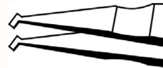
D00837 SMD Tweezers for handling and positioning 1mm components (13.SA SMD) 120mm