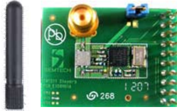
SM12xx RF Module + 915 MHz helical Antenna