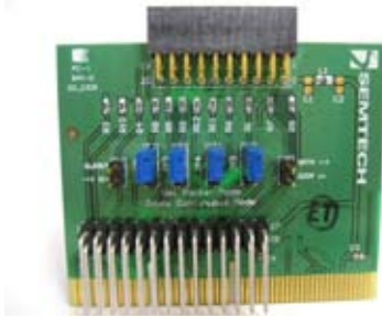
PICtail™ / PICtail™ Plus extension board