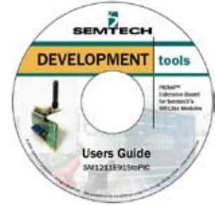
User's Guide (CD)