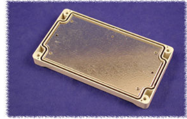
Panel Mounted in Lid (Hardware not included)