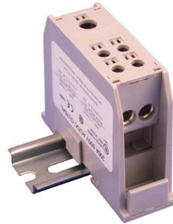
Shown here on Din Rail

200 Amps, 600 Volts (AC/DC) 1,000V AC/DC CE (IEC 60947-7-1) DIN Rail mountable on 7.5 x 35 mm rail.