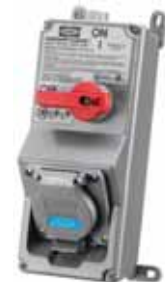
HBLMITL - For use with Watertight Safety-Shroud receptacles, see page B-39.

Notes: For technical information on Twist-Lock® and Watertight Safety-Shroud Devices see pages B-69 and 70.