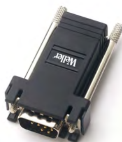
WX Adapter for WFE / WHP