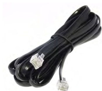
WX connection cable