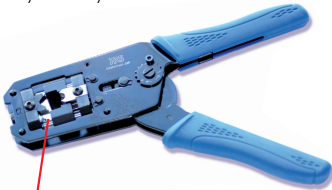
Sub Insert for TM11/TM21/TM31

Hirose's RJ45 modular plugs. The innovative design of the tool allows high quality simultaneous crimping of the crimp contact and the cable clamp saving time. The prepared connector cable assembly is simply inserted into the tool, a audible snap confirms the connector is correctly positioned and locked into place, the termination operation is then completed by releasing and closing the ratchet. The tool comes complete with changeable crimpers and anvils to terminate TM11, TM21 & TM31 series.