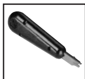
Punch-down Connecting Tool