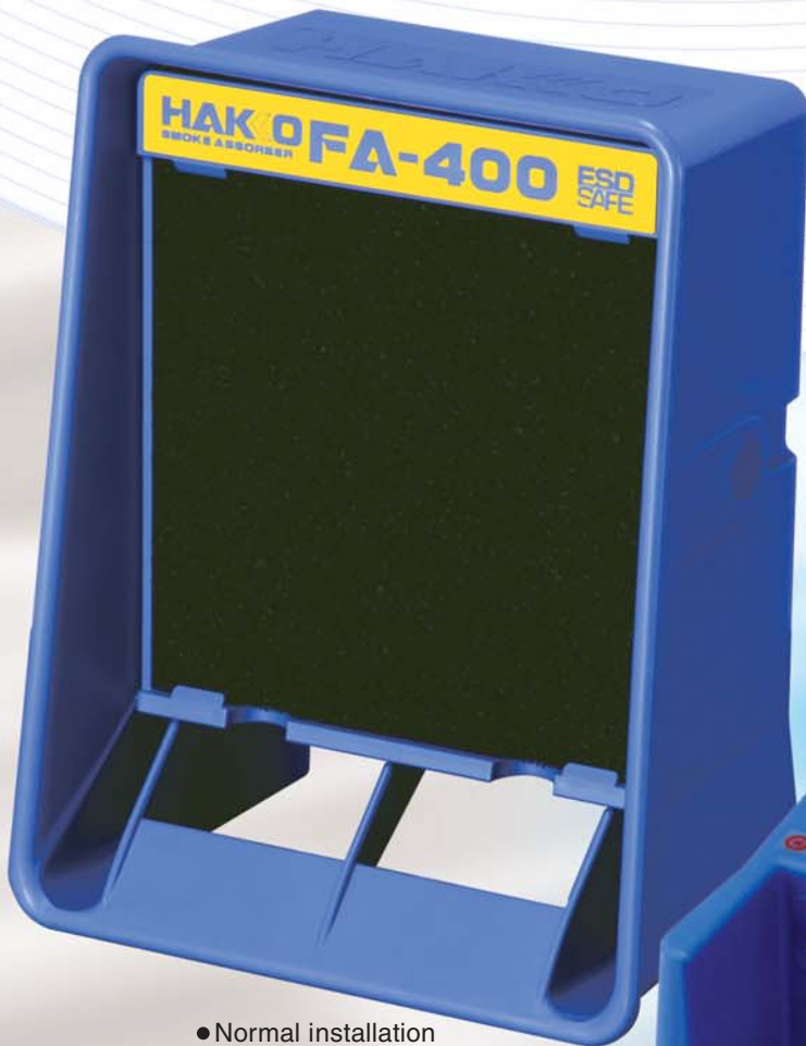
• Normal installation