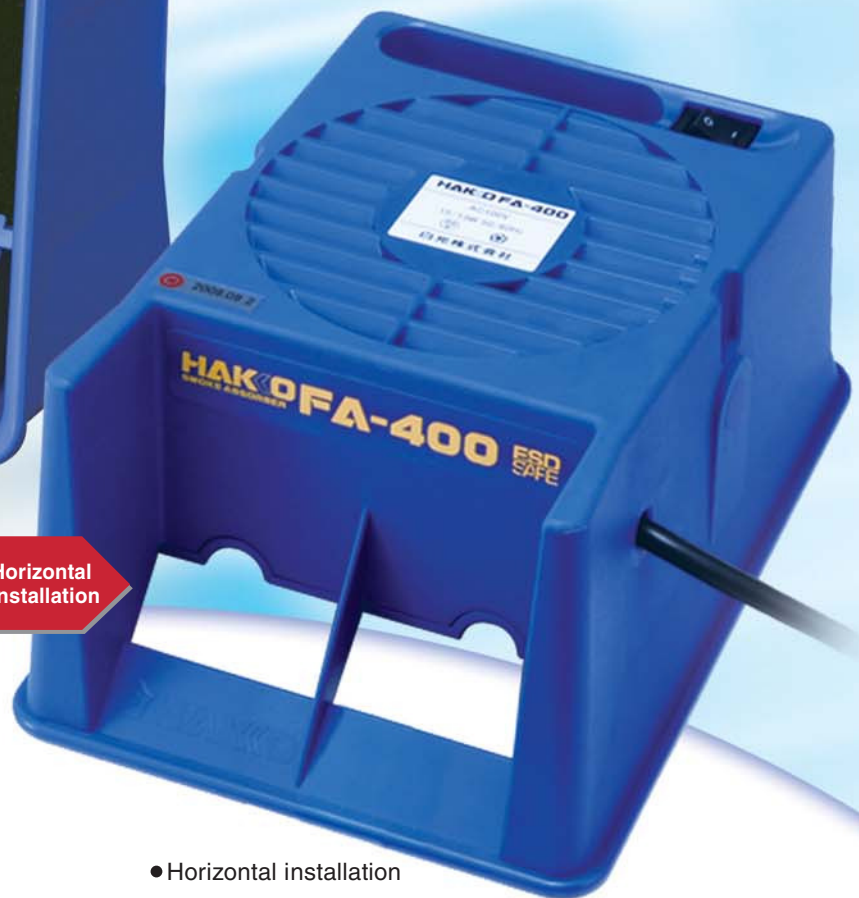
• Horizontal installation