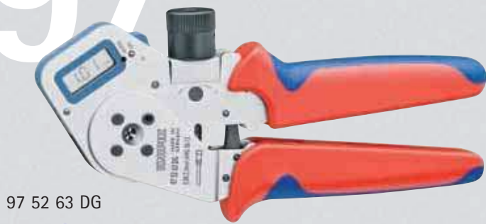
97 52 63 DG