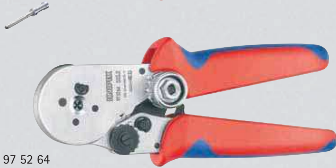
97 52 64