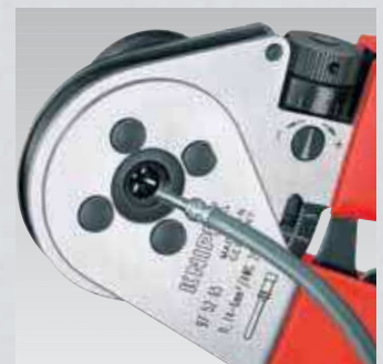
Four-mandrel squeezing for exact crimping performance