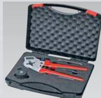
97 52 63/65 DG: Pliers with locator and service tools in a plastic case with foam insert