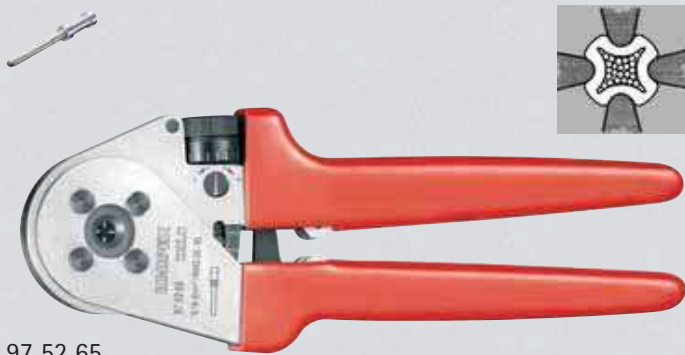
97 52 65