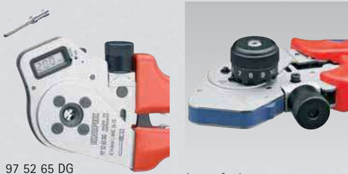
97 52 65 DG