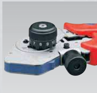
Locator for the contacts