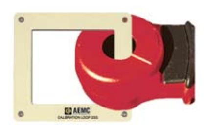
Calibration Check Loop (included)