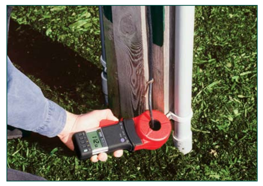
Model 3731 performing a ground rod resistance check.

The Models 3711 and 3731 measure ground rod and grid resistance in any environment without the use of auxiliary ground rods. Clamp-on ground resistance testers are used on multi-grounded systems without disconnecting the ground under test. The Models 3711 and 3731 simply clamp around the ground conductor or rod and measures the resistance to ground fast and accurately.