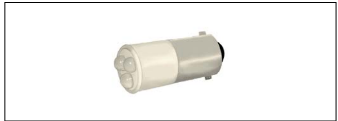
Lamp base in accordance to DIN EN 60061-1: BA9s

Electrical and optical data are measured at an ambient temperature of T_A = 25^\circ\text{C}