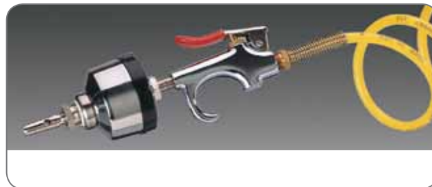
Optional gun/hose kit (p/n 91-6150).