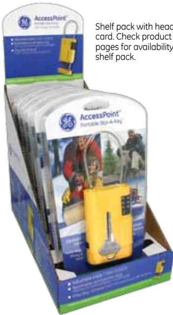
Shelf pack with header card. Check product pages for availability of shelf pack.