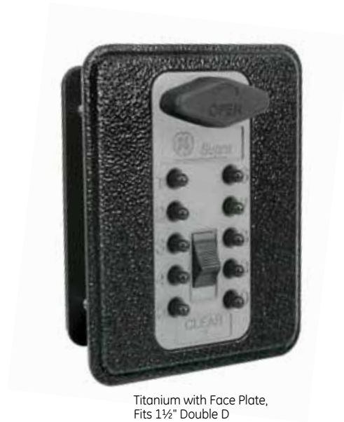
Titanium with Face Plate, Fits 1 1/2" Double D