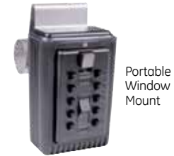
Portable Window Mount