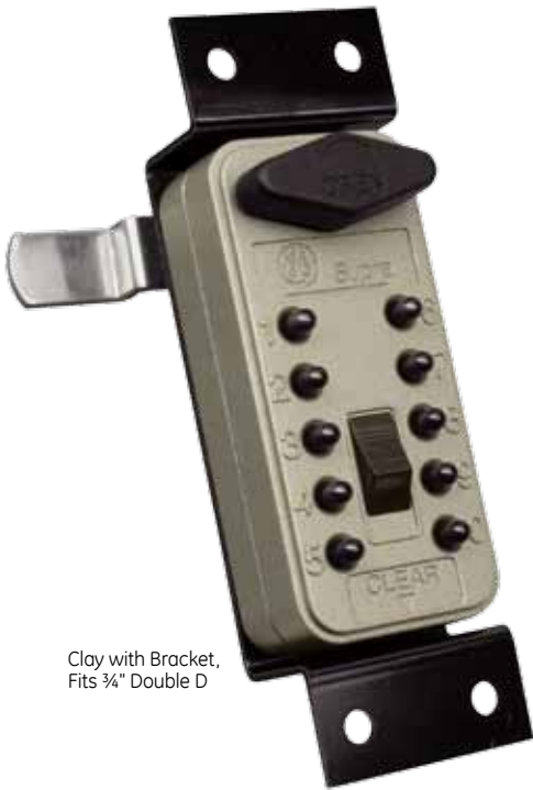
Clay with Bracket, Fits 3/4" Double D