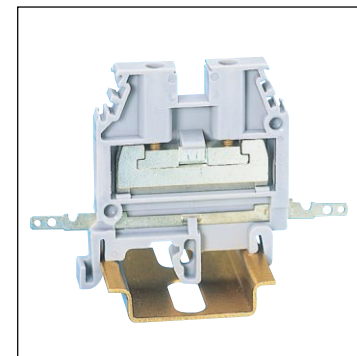
Figure 1. MTC 6 with shield connector

The thermocouple principle is based on the reaction of different metals to temperature. When thermocouple wires are terminated or connected, the "metal balance" must be maintained. The introduction of a foreign material (such as copper) results in loss of signal strength and integrity.