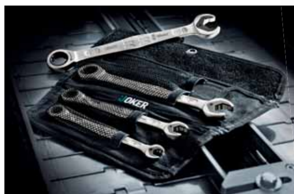
The 4-piece Joker wrench set in a practical tool pouch.

The Joker performs fastening jobs in almost every conceivable situation, quickly and with great precision. The ratcheting feature at the ring end boasts an exceptional, fine tooth mechanism – 80 teeth in all – which provides greater flexibility, even in very confined working spaces. The specially forged geometry, in combination with the high-performance chrome-molybdenum steel and nickel-chrome coating, means that you win three times over: longer service life, high resistance to wear and great protection against corrosion.