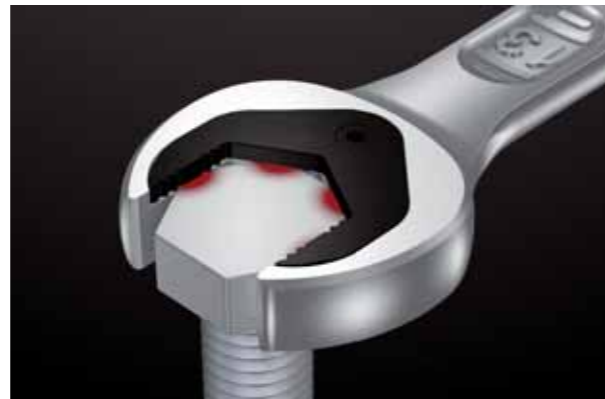
Avoids slipping off fasteners, for faster work!