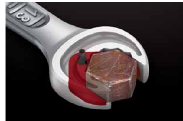
Prevents the risk of slipping for fewer injuries.