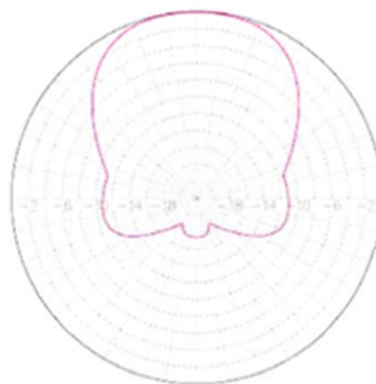
Typical Antenna Propagation