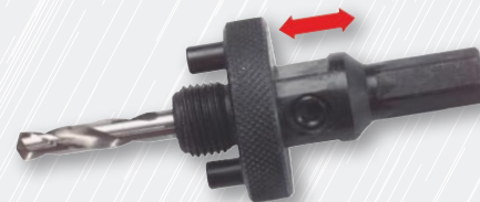
No. 106 202