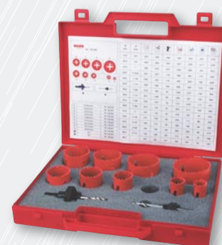
Nr. 106 306