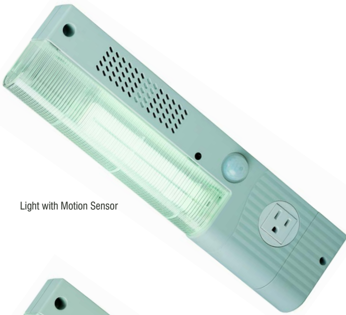
Light with Motion Sensor