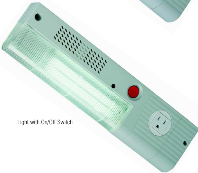
Light with On/Off Switch