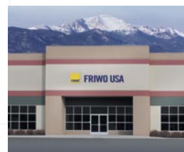
North America, Colorado Springs