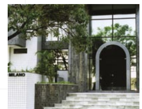
South America, São Paulo