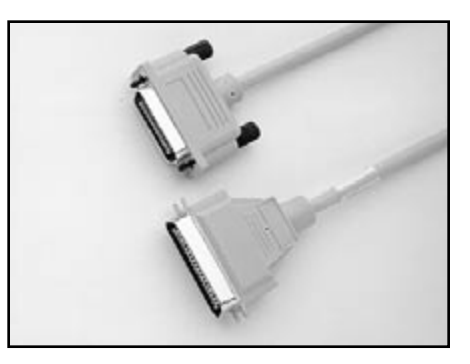
Model 8530 Centronics Adapter: IEEE-488 to Centronics cable adapter. Connects to Model 2001/2002 IEEE-488 port and any Centronics compatible printer for direct data output. Cable Length: 2m (6.6 ft).