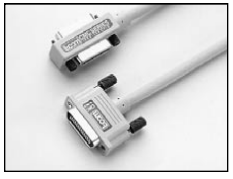
Model 7006-*: Single-shielded GPIB cable terminated with one feed through style and one straight on IEEE-488 connector. The mating thumb screws are metric. 7006-1 1m (3.3 ft) 7006-2 2m (6.6 ft)