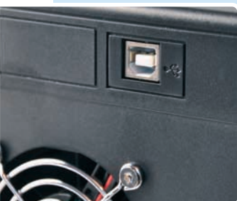
USB Communication Ports