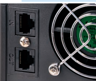
Modem, Phone Line, Network Surge Protection