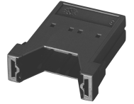
Abbildung stellvertretend für alle verfügbaren Polzahlen.

Subseries Heavy duty connector heavy|mate - C146 M