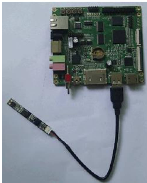
CAM8100-U + Devkit8000