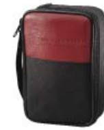
U1174A Soft carrying case