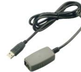
U1173A IR-USB cable