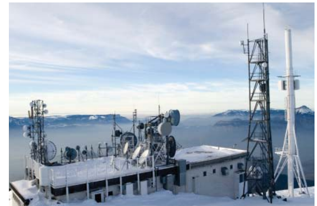
Ensure no downtime at base station, even during cold winter.