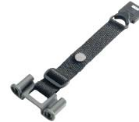
U1171A Magnetic hanging kit