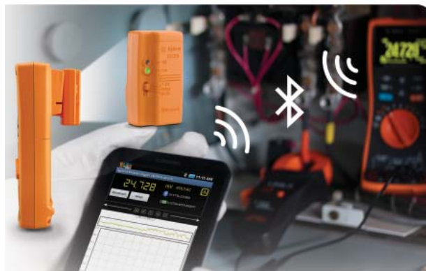
Remote metering and logging via bluetooth.