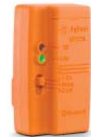
U1177A Bluetooth adapter