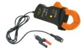
U1583B AC current clamp