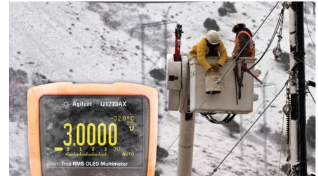
Capable of operating down to -40^{\circ}\text{C} - deliver immediate and accurate results without the need to warm up.