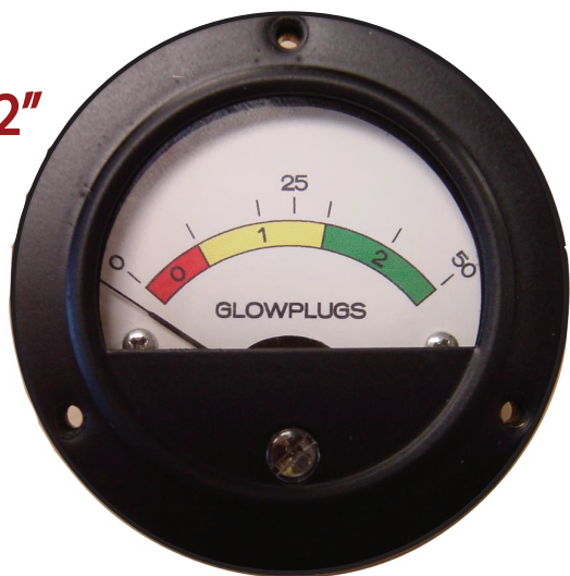
17/3 MM - D.C Moving Coil 552-MM - A.C. Repulsion