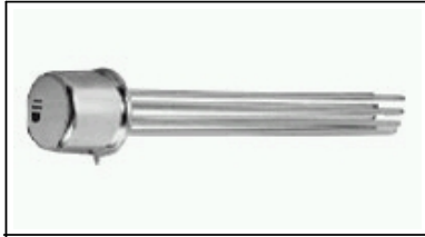
JMSCD - 5XP (1 - 1617128 - 9)