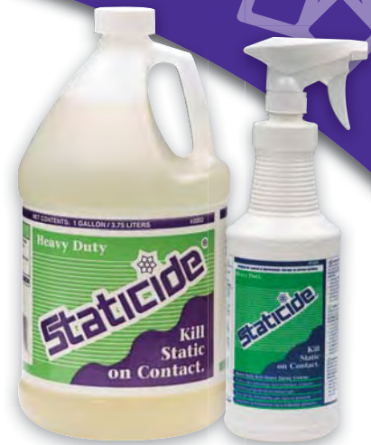
#2002 / 2005

Product #2005: 1-quart bottle / 12 quarts per case (includes trigger sprayer) Product #2002: 1-gallon bottle / 4 gallons per case Product #2002-5: 5-gallon pail Product # 2002-2: 50-gallon drum