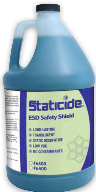
#6300 / 6400

Like our Staticide® Topicals, in the right situation, Staticide® ESD Safety Shield provides a cost-effective solution without sacrificing efficiency and quality. Suitable to use where static interferes with production assembly and ideal to use in static control environments to prevent ESD events. Use on electronic packaging, conveyor parts, and on objects in electronic assembly work areas.