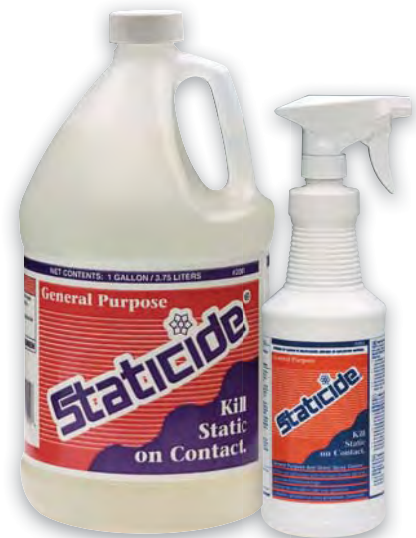
#2001 / 2003

Product #2003: 1-quart bottle / 12 quarts per case (including trigger sprayer) Product #2001: 1-gallon bottle / 4 gallons per case Product #2001-5: 5-gallon pail Product # 2001-2: 50-gallon drum