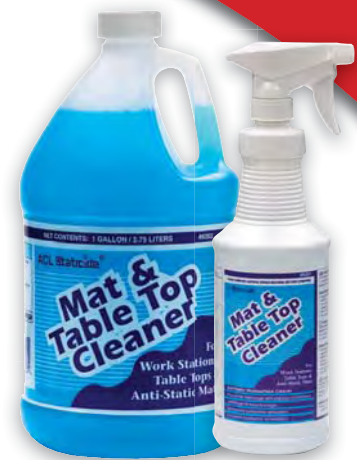
#6002 / 6001

Product #6002: Gallon bottle / 4 gallons per case