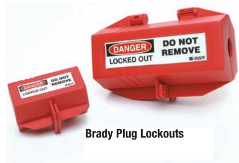
Brady Plug Lockouts