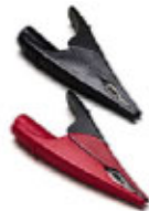
AC285-FL: Alligator Clips.