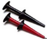
AC280-FL: Hook Clips.