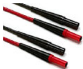
196-3523-00: Extender Leads (1.5 m).