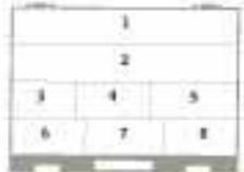
Bill Diagram This edge is top.

Additional information at www.pcsdata.com or contact a TE Connectivity authorized distributor