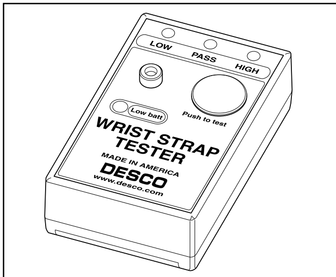
Figure 1. Model 19240 Wrist Strap Tester

Pass Range 800K Ohms to 10 Megohms, 9 Volt Battery Operation