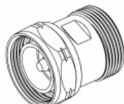
272292 Adapter, 7/16 Plug to 7/16 Jack, 50 Ohm, Low PIM