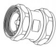
272134 Adapter, 7/16 Plug to 7/16 Plug, 50 Ohm, Low PIM