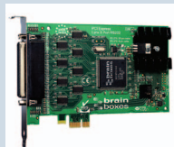
PX-275: PCIe 8xRS232 DB25 1MBaud