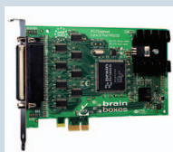
PX-279: PCIe 8xRS232 1MBaud