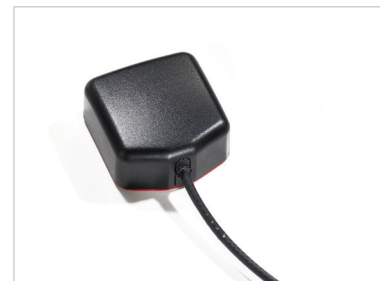
Image does not reflect the actual size of the antenna

This high-performance antenna is designed for vehicle and fleet tracking applications. The very small size and lightweight make this GPS antenna unique in the market and perfect for various commercial and industrial applications. With a low noise figure and high-linearity LNA, this antenna is the ideal solution for the most extreme and demanding applications where reliable satellite reception and high accuracy are required. The interface connector is available in SMA, TNC, or other options.