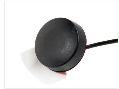
Image does not reflect the actual size of the antenna

This high-performance antenna is designed for vehicle and fleet tracking applications. The very small size and lightweight make this GPS antenna unique in the market and perfect for various commercial and industrial applications. With a low noise figure and high-linearity LNA, this antenna is the ideal solution for the most extreme and demanding applications where reliable satellite reception and high accuracy are required. The interface connector is available in SMA, TNC, or other options.