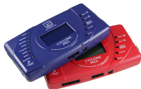
Cyclone PRO & Cyclone MAX

The USB Multilink Universal and Universal FX are intended for development and are not designed to accommodate the demands of production programming. However, P&E's Cyclone programmers are specifically engineered to withstand the rigors of a production environment and will provide a seamless transition from the Multilink. More information is available online at pemicro.com/cyclonepro and pemicro.com/cyclonemax .