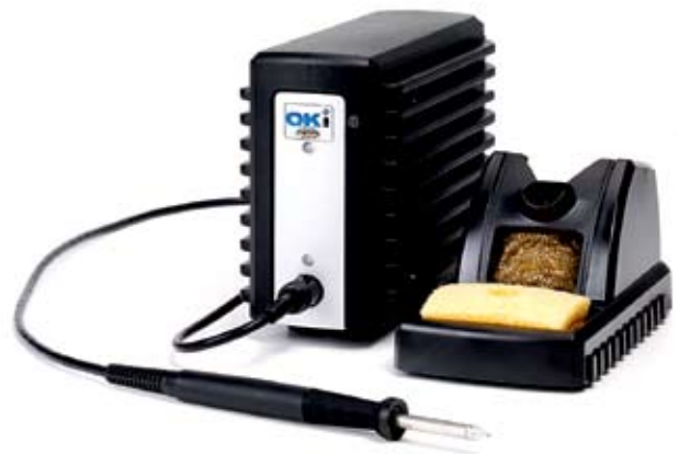
MFR-1160 (MFR-1100 Single Output Soldering & Rework System with MFR-H6-SSC hand-piece)