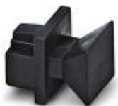
Dust protection caps for RJ45 female connector

Dust protection - FL RJ45 PROTECT CAP - 2832991