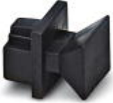
Dust protection caps for RJ45 female connector

Dust protection - FL RJ45 PROTECT CAP - 2832991