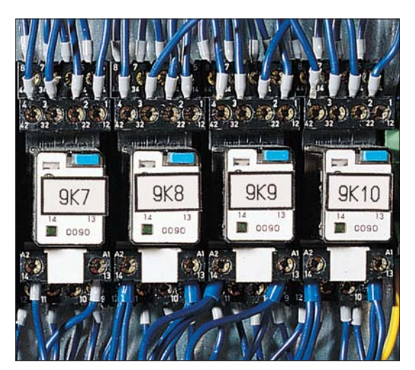
Helatag cotton fabric labels will adhere to most surfaces.