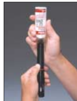
Refills in just 20 seconds with standard butane lighter fuel.