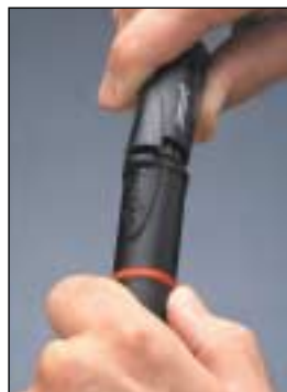
Automatic safety fuel cut-off when cap is replaced.